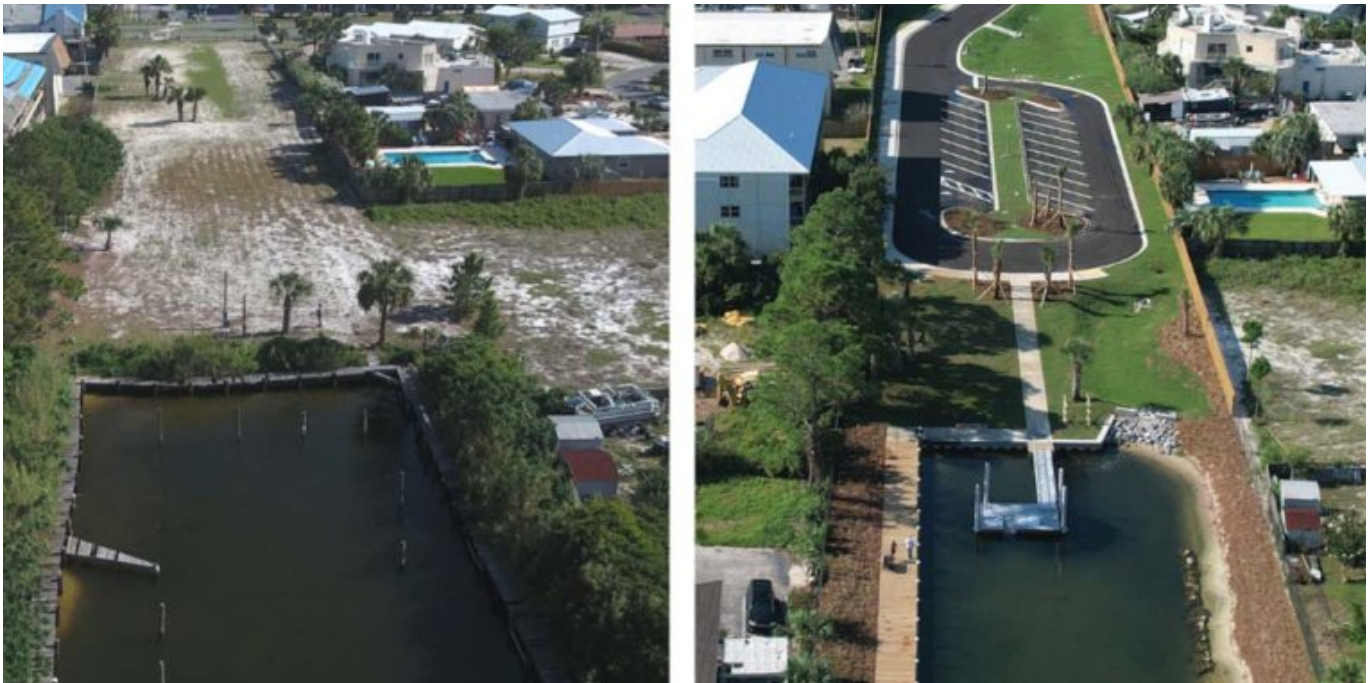
( https://www.getthecoast.com/the-newly-renovated-1-1-million-okaloosa-island-boat-basin-to-open-next-week/ )

The newly renovated $1.1 million Okaloosa Island Boat Basin to open next week ( https://www.getthecoast.com/the-newly-renovated-1-1-million-okaloosa-island-boat-basin-to-open-next-week/ )