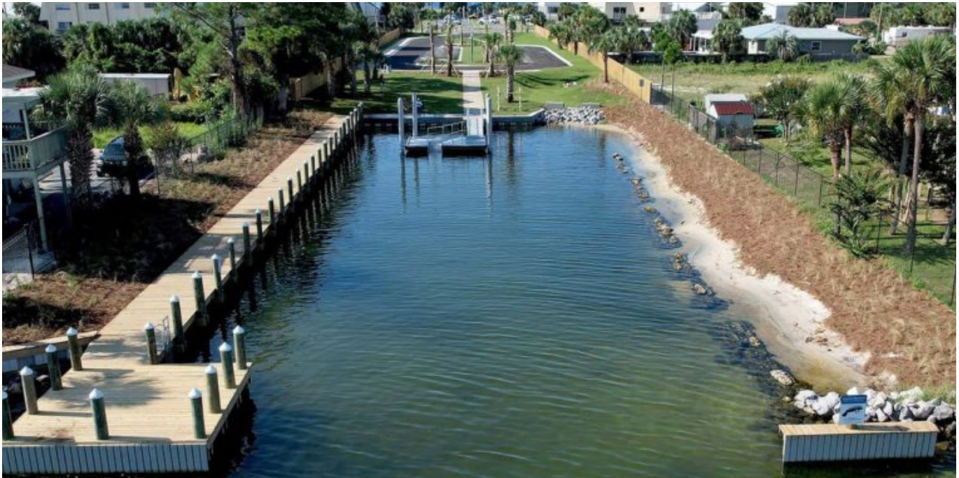
( https://www.getthecoast.com/the-newly-renovated-boat-basin-on-okaloosa-island-is-now-open-features-kayak-launch/ )

The newly renovated Boat Basin on Okaloosa Island is now open, features kayak launch ( https://www.getthecoast.com/the-newly-renovated-boat-basin-on-okaloosa-island-is-now-open-features-kayak-launch/ )